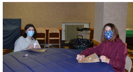
Girls filled bags of treats for residents at the Masonic Home while waiting for the Zoom meeting to start